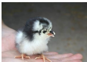
New hatchlings this year at Morning Sound Farm

We also have a field trip to a splash pad planned for early August. We have been doing pool days as well and we will continue to do those throughout the summer.